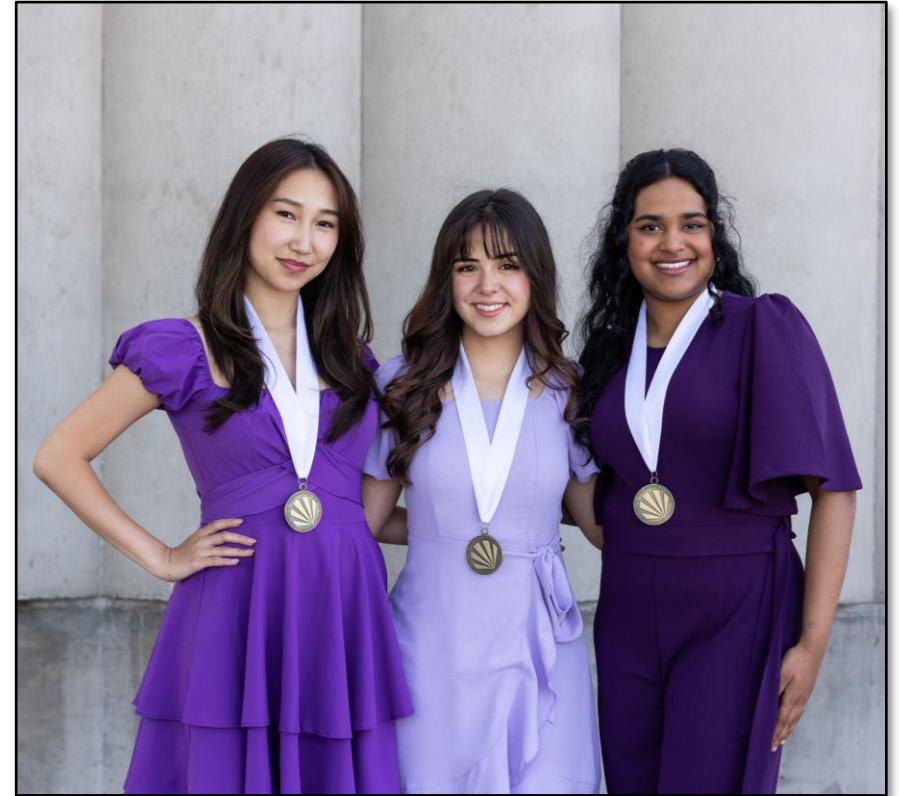
Distinguished Young Women of Los Angeles County 2025 Representatives