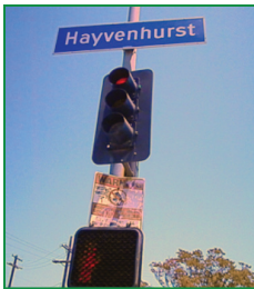
Some signs were posted illegally on traffic control poles.