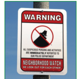
Brand new signs were strategically placed per LA City Guidelines.