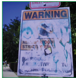
Some were damaged almost beyond recognition.