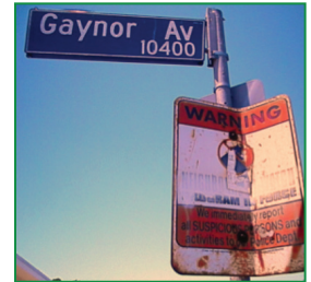
Many were old, bent, damaged, rusty and had been defaced.